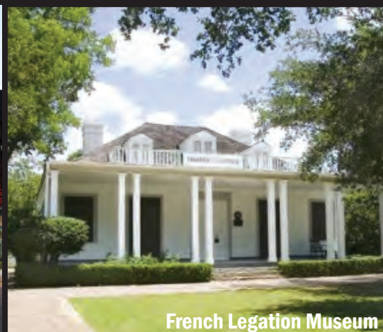
French Legation Museum