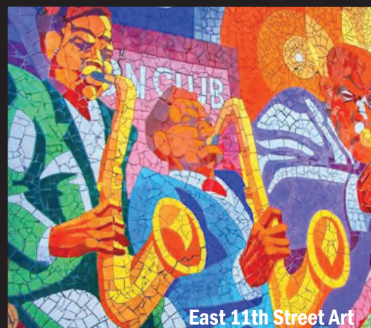
East 11th Street Art